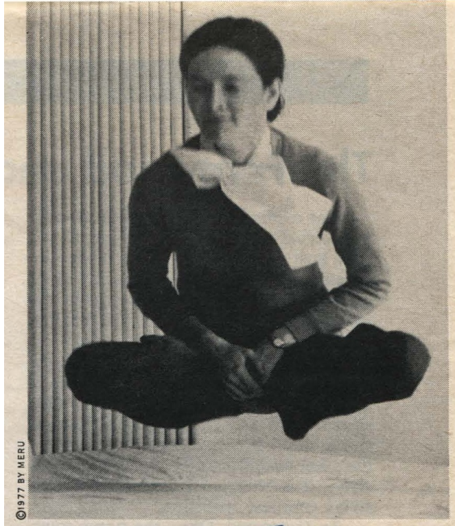
TM "Levitation" Photo Like enjoying a toy.

What is a maharishi to do when sales start to grow sluggish? One answer: announce a shiny new product. Maharishi Mahesh Yogi, the founder and guru of Transcendental Meditation (TIME cover, Oct. 13, 1975), has done just that. TM monthly enrollment slid from its 1975 peak of 40,000 trainees a month to a low of 4,000 this year, partly because the Maharishi invited several thousand of his teachers to TM headquarters in Switzerland to acquaint them with the organisation's new wares. The teachers have now brought those wares to the American market: lessons that will lead trainees to the Siddhis, or supernatural powers. These include the ability to walk through walls, feel infinite compassion, become invisible. But the most controversial of the Siddhis is levitation – the ability to hover in mid-air and fly around the room, as one TM teacher puts it, "like Peter Pan."